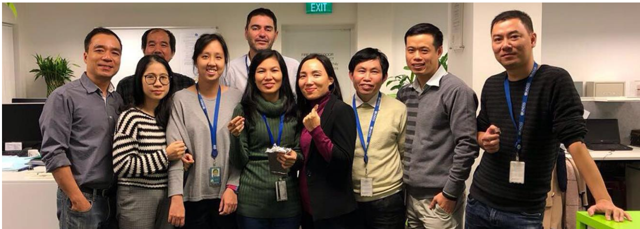
Colleagues at Green One UN House (GOUNH) in Hanoi, Vietnam