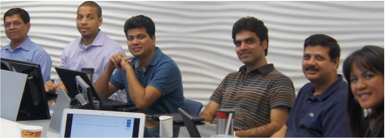
Members of the UNDP Atlas ERP team.